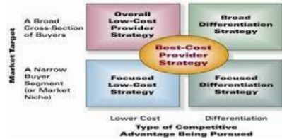
Figure 2. Five Generic Porter's Strategies

According to (24), there are five generic competitive strategies that can be used by industries or companies in order to survive and be able to increase their business in intense competition including the following: First, Low Cost Provider Strategy, this strategy seeks to achieve higher costs, lower overall than competitors on comparable products that can appeal to a wider range of consumers; Second, Broad Differentiation Strategy, this strategy seeks to differentiate the company's product offerings from competitors with aspects that will appeal to a broad range of buyers; Third, Focuses Low Cost Strategy, this strategy concentrates on the needs and requirements of smaller buyer segments and strives to meet these needs at a lower cost than competitors; Fourth, Focused Differentiation Strategy, this strategy concentrates on smaller buyer segments and outperforms competitors by offering several special aspects to consumers that meet targets and requirements that are superior to competitors; Fifth, Best Cost Provider Strategy, the strategy seeks to combine high-end product attributes at a lower cost than competitors. The theory above is the result of the adoption and development of the theory put forward by Porter about the three generic strategies. The following is a chart on Porter's five generic strategy analysis.