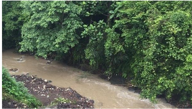
Figure 1. Nyanyi River, South Bali, showing the location where Cyclocheilichthys apogon were collected.