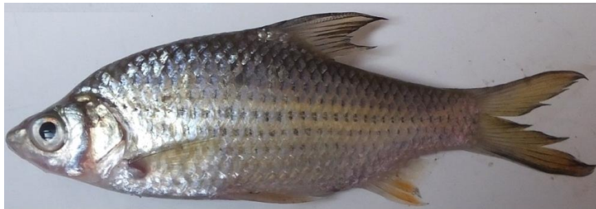
Figure 2. Specimen of Cyclocheilichthys apogon collected on Nyanyi River, South Bali.

Cyclocheilichthys apogon is distinguished from the other species of Cyclocheilichthys by no barbels in snout but there are conspicuous folds of the skin above upper lip. Other specific characters of the four preserved specimens are as follows: dorsal fin rays 12; anal fin rays 8; pectoral fin rays 17; lateral line scales 34; head pointed, lips are swollen; dorsal deeply concave; anal concave; caudal forked. Coloration in fresh specimen: yellowish silver, upper parts are brown, and each scale has a black spot at the base; vertical fins have brownish colours, the others more or less hyaline. There is a black blotch at the caudal peduncle.