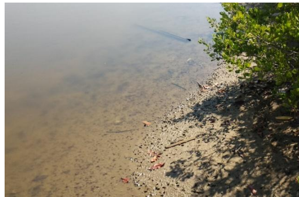
Figure 1. Estuary, location where Oreochromis niloticus was collected in Masalembo Island