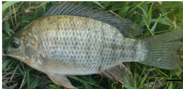
Figure 2. Specimen of Oreochromis niloticus GBI.On.III.2019 captured on 2 June 2019 from Masalembo Island

Several specimens collected in Masalembo Island were identified as Oreochromis niloticus . Specific morphological characters are as follows: scales cycloid; 3 rows of scales on the cheek; gill rakers short; teeth widened; maxilla and lower jaw equal; pectoral fin pointed; dorsal, pectoral and anal fins blunt; caudal scaly. Coloration of fresh specimen: upper margin of dorsal fin black or grey, the melanin sometimes slightly mixed with red, not orange or vermilion even in breeding males. Head and trunk of breeding male suffused with red; in some localities, lower jaw, pelvis and anterior part of anal fin black; caudal fin covered with narrow vertical stripes; anal fin faintly barred; about 9 narrow dark bars on sides body; dark blotch at corner of operculum (Fig. 2). Morphometric and meristic characters of O. niloticus are given in (Table 1).